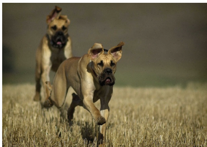
Photo 1 - Champion Myhalston Mr Malachi and his sister Champion Myhalston Miss Kiara (11 month old)