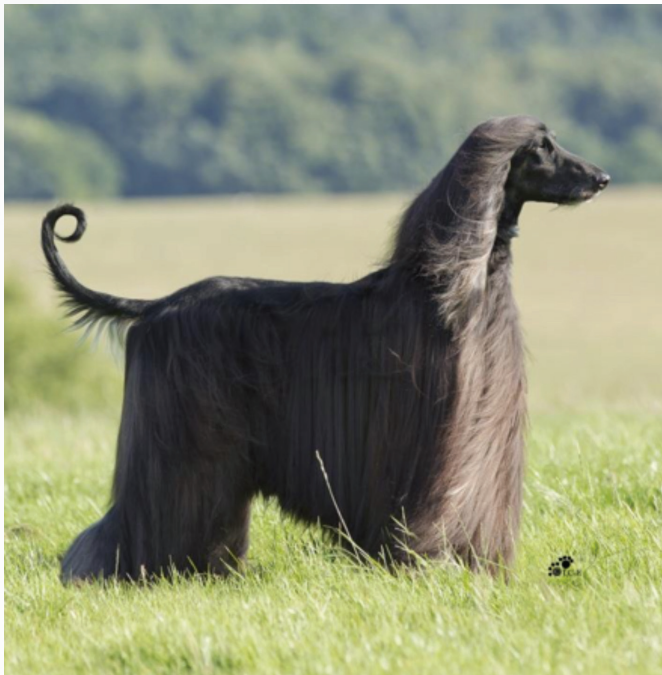
Photo 3 - Rashid Ebn Hugo Von Haussman at Myhalston after eating Canine Dermatitis DRM

Also not only did the diet help his coat, but his muscle condition too. Rashid is shown all over Europe and has to be in excellent body condition (Photo 3 & 4).