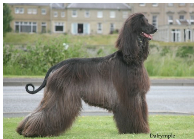
Photo 2 - Rashid Ebn Hugo Von Haussman before eating Canine Dermatitis DRM